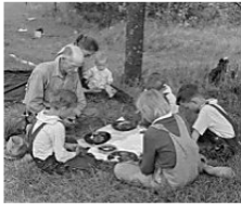
One Of The Worst Times In U.S. History Seen In Photos For The First Time Historical Topic