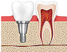
New Dental Technology Now Available to Public Cosmetic Dental