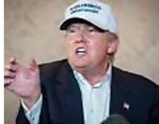
Here's What World Leaders Say About Donald Trump Fortune.com