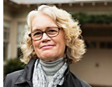
What Will Your Social Security Benefits Be? [Calculator] Regions Bank