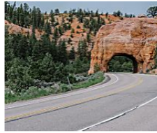
Utah's Scenic Byway 12: A Journey Through Time Scenic Byway Visit Utah